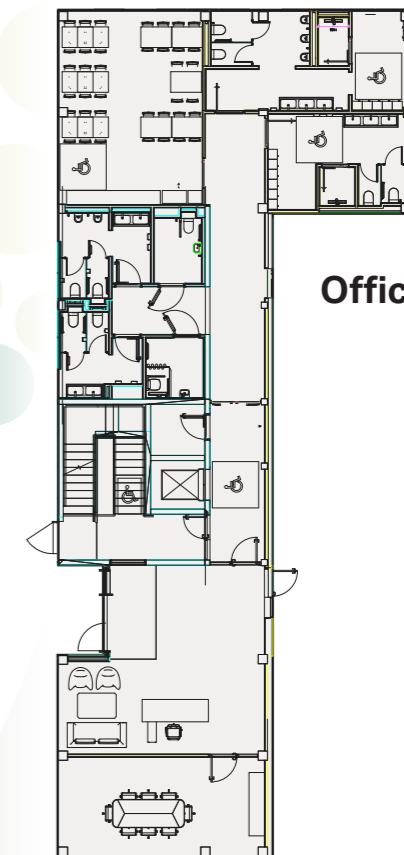
Office floor plan